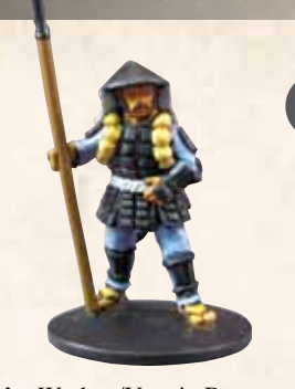
Skin: Wash w/Vermin Brown Pants/shirt: Highlight Shadow Grey/Skull White (75/25) Rice rations: Wash with Vermin Brown