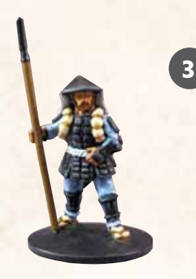
Skin: Highlight Dwarf Flesh Pants/shirt: Highlight Shadow Grey/Skull White (50/50) Rice rations: Highlight Bleached Bone