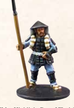
Skin: Highlight Dwarf Flesh/ Skull White (75/25) Rice rations: Highlight Skull White

Armor: Highlight with Chaos Black/Shadow Grey (50/50) Helm cloth/belt: Highlight Skull White Scabbard: Highlight Scorched Brown/Bleached Bone (50/50)