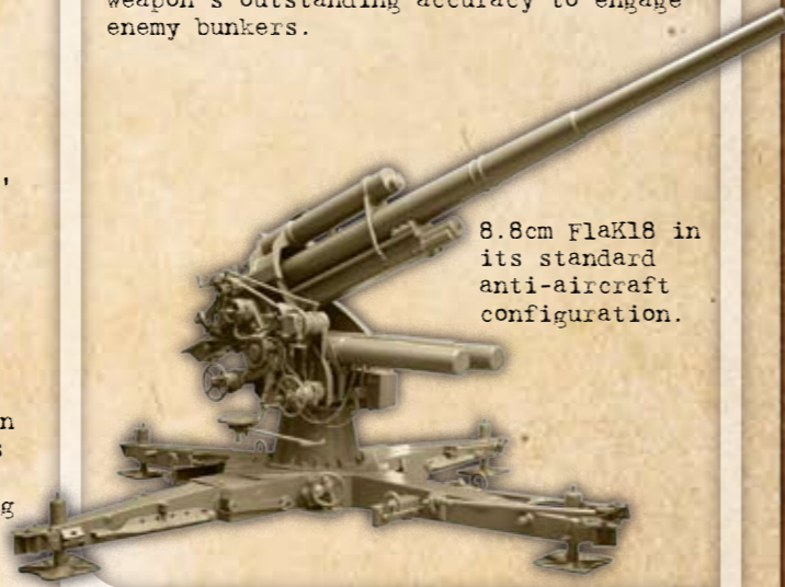
8.8cm FlaK18 in its standard anti-aircraft configuration.

The Bunkerflak mounted a standard 8.8cm FlaK18 gun on an armoured self-propelled mounting. It retained the large crew required to operate the big gun at its maximum performance. The crews were trained to use their weapon's outstanding accuracy to engage enemy bunkers.