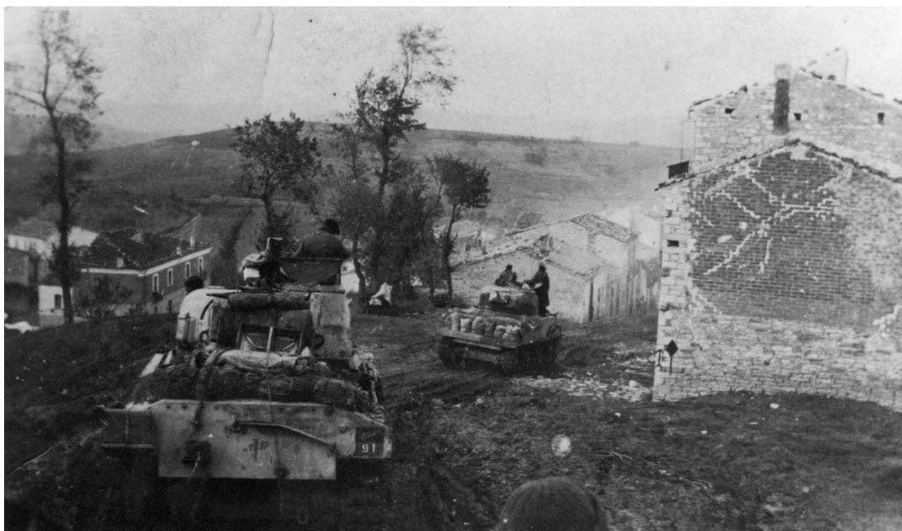
Shermans from the 18th Armoured Regiment entering Guardiagrele

Entering Italy saw the divisional symbols change from the common British system of having the unit and divisional symbols on opposite sides of the tank, to a combined insignia of a white fern leaf on black, in the top half and the unit number on the unit colour in the bottom half (see the diagram on the following page).