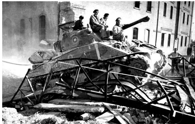
A Sherman in Italy, probably from 19th Armoured Regiment, 'C' squadron.

Due to the poor reputation British armoured support had in the eyes of New Zealanders, due mainly to 4 New Zealand Infantry Brigade at Ruweisat Ridge and 6 NZ Infantry Brigade at El Mreir being overrun by German tanks when the British armour failed to show up, forced General Freyberg, overall commander of the New Zealand forces, to take matters into his own hands. Failing to convince the New Zealand government that there was a need for an armoured brigade he decided to convert an existing Brigade, namely the 4 th New Zealand Infantry Brigade, into the 4 th New Zealand Armoured Brigade.