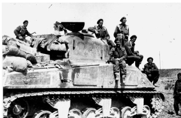
A Sherman from the 18 th Armoured Regiment, 'C' squadron waiting to cross Po River.

19 th Armoured Brigade was the first New Zealand tanks to see action, they were asked to assist the 3/8 Punjab Regiment, 19 th Indian Brigade, 8 th Indian Division to attack Perano to check the state of the Sangro bridge.