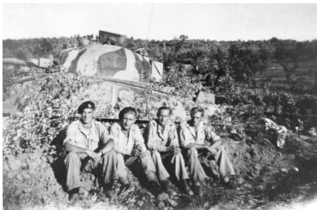
A Sherman from the 18 th Armoured Regiment painted in mud-grey with blue-black patches.

The front then stabilised, ending the efforts in 1943.