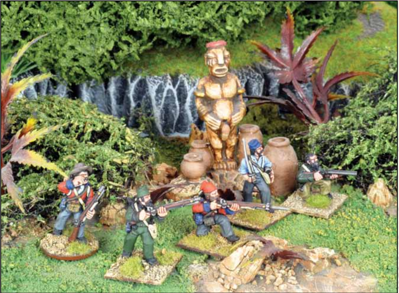
Above: British regulars and Cape Mounted Rifles (from 1st Corps) advance through a native encampment.

Xhosa is pronounced with a characteristic clicking sound on the 'X' - the sound you make when trying to get a horse to 'gee-up' - which caused pronunciation problems for whites at the time, and for non-South Africans ever since. The most acceptable Anglicisation is 'Xhosa', pronounced 'Kor-sah' (and most definitely not 'ex-oh-shar'!). At the time, both Dutch and English settlers took the easy option and referred to them by an old Arabic word for black African unbelievers, 'Kaffir'. Then, this word was arguably no more than dismissive in tone, but it has since been burdened with two centuries of racial disdain making it a hugely offensive term to any person of black South African origin. Thus what were once known as the 'Kaffir Wars' are now generally known as the Eastern Cape Frontier Wars.