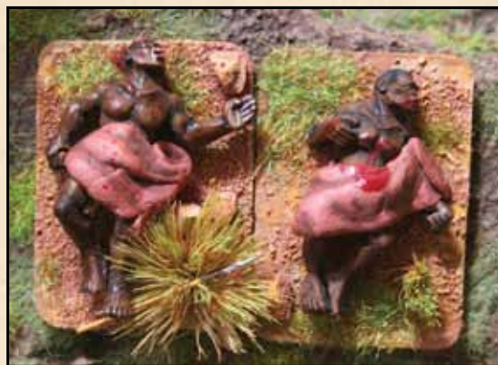
Right: The wonders of Milliput; African casualties from the 'Darkest Africa' series turned into Xhosa with added cloaks.