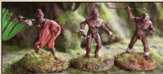
Above: These Foundry 'stark naked spearmen' serve as extra Xhosa.

Maori War British would also be broadly suitable. At the time of writing there are no cavalry figures - other than the CMR - available, but British Lancers from the Foundry Indian Mutiny range (BRV228) are perfect for the 12th Lancers (one of the few units who wore white covers with neck-curtains over their forage caps on the Frontier) during the 1852 BaSotholand expedition, while the 'Native Light Cavalry' (BRV230) could at a pinch be painted up as 7th Dragoons at the time of their charge on the Gwangqa river in 1846. Foundry also produce an excellent transport wagon in their Zulu War range (BSDA3) which is appropriate to pretty much any southern African conflict from about 1800 to the 1906 Rebellion.