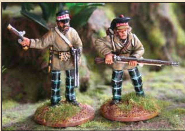
Above: The 8th CFW in 40mm; two of the HLBS Co.'s 74th Highlanders, including an officer with pistol and shotgun...

the HLBS range is that, if you are planning to go for man-for-man skirmishes, a wide range of troop types and figures is always preferable, and at the moment these are simply not available. Personally I'd like to see some Xhosa casualties - I can't quite reconcile myself in skirmish games to just removing 'dead' figures from the board without replacing them with a marker, especially when it is such large beautiful figures that are in effect disappearing into thin air! - and it would be nice to see some red-coats and Cape Mounted Riflemen in this scale. So, gentle reader, start buying - and hopefully HLBS will be prompted to release some more!