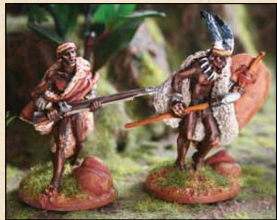
Above: ...and some of the Xhosa from the same manufacturer.