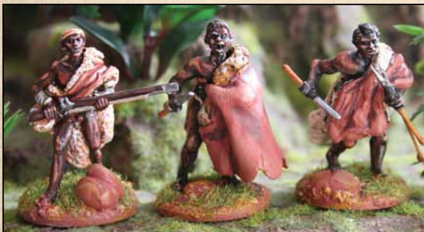
Above: Reinforcements; two Xhosa converted from Sash and Saber 40mm Zulus (largely by adding Milliput cloaks to disguise uniquely Zulu aspects of costume) with an HLBS equivalent on the left.

In fact it is not impossible to mix and match the HLBS range with other 40mm figures, particularly the British troops from the Sash and Saber Zulu War range ( www.sashandsaber.com ). S+S do a nice selection of infantry types representing the 24th Regiment in Zululand which could equally stand for the same regiment on the Eastern Cape a year earlier, and could be used to fight HLBS Xhosa. Indeed, having bought a packet of S+S Zulus - which come in mix-and-match bodies, legs and heads packs - I experimented by putting together a couple of figures wearing the least possible distinctively Zulu costume, then using Milliput to mask this with cloaks. I was certainly pleased with the results - not least because it the two ranges prove to be largely comparable in size and proportion.