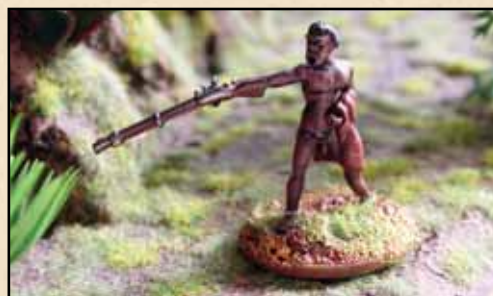
Above: The author's favourite - a Xhosa warrior swings his flint-lock musket one-handed.