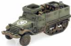
British: M5 half-track.