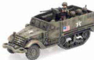
USA: M3 half-track.