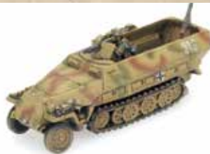
German: Sd Kfz 251.